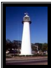
MISSISSIPPI LIGHT HOUSE