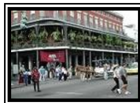
BOURBON STREET NEW ORLEANS